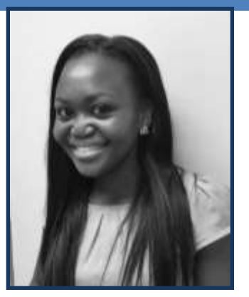
By: Lelethu Thiso (Iliso Consulting)

To contribute articles for this section please contact the editor on: kmmekwa@phb.co.za